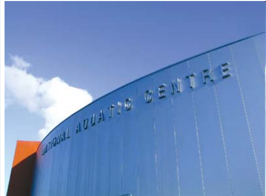
National Aquatic Centre