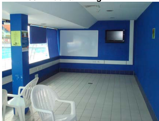
IOC & TD Meeting Room