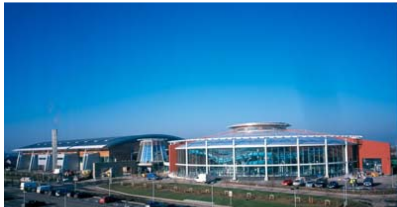
Main building of National Aquatic Centre