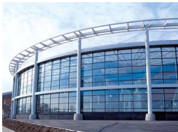
National Aquatic Centre