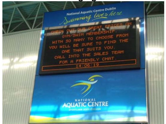
Scores & Information Board