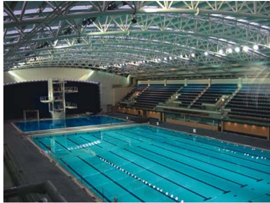
50m Pool & Diving Pit